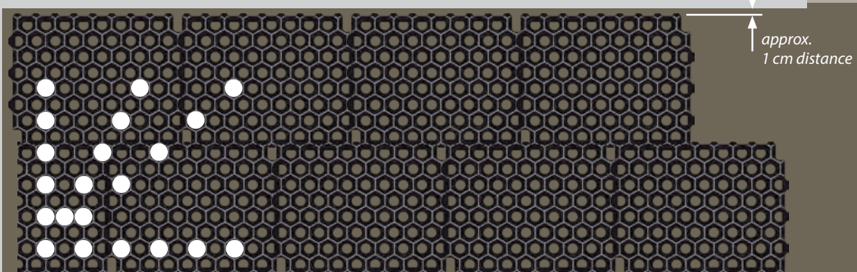
Angle examples for marking with CORE Grass markers